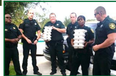
North District Deputies Ready Delivery